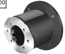
TABLE 10 - NEMA Frames 324TC/TSC - 405TC/TSC, 324UC/USC - 405UC/USC