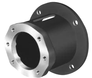
TABLE 7 - NEMA Frames 56C, 143TC/145TC, 182UC/184UC Horizontal Mounting (or Vertical Mounting - Option A)