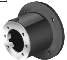
TABLE 8B - NEMA Frames 182TC - 256TC, 213UC - 256UC Horizontal Mounting